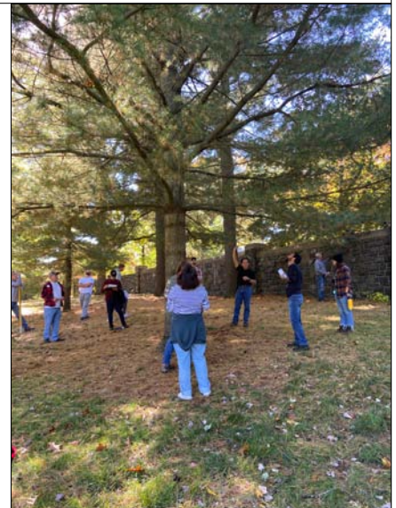
Students are encouraged to look for acorns, look at leaves and bark and recognize how to identify each trees.