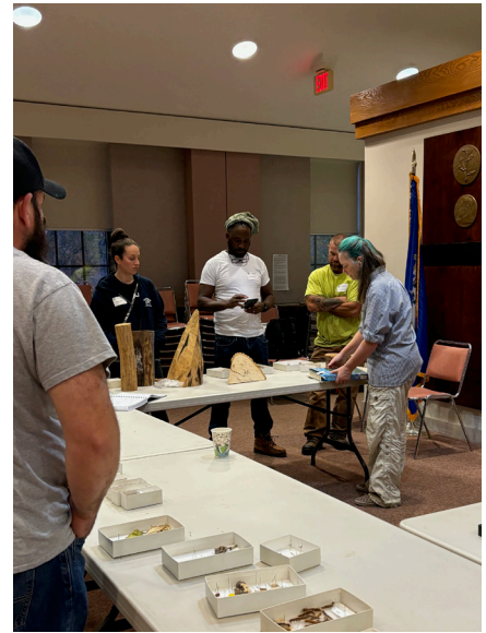
Arboriculture 101 Fall 2024