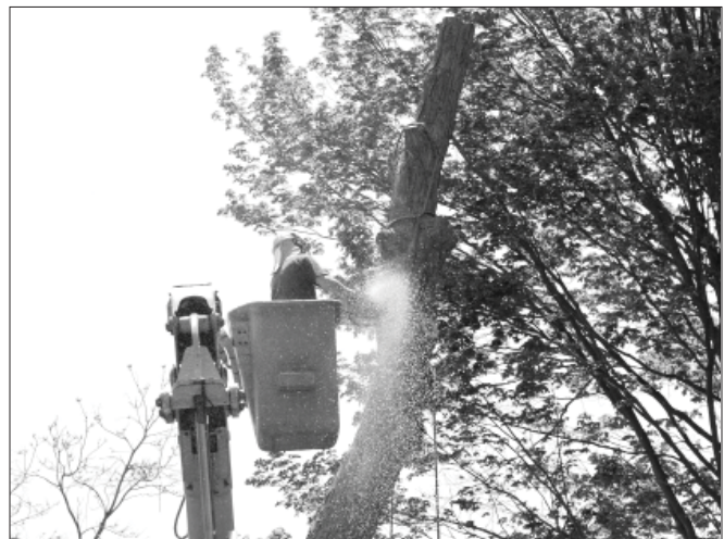
Removing or pruning trees is inherently dangerous, especially when it involves releasing large pieces of wood from a height.