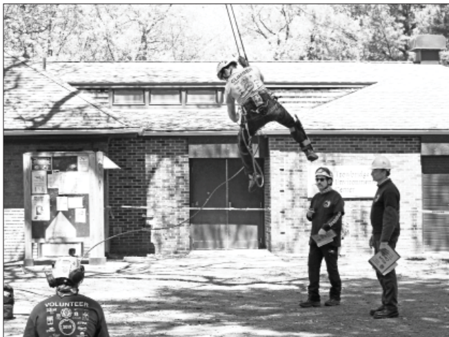
Completing a work climb, as the timers and judges look on. Climbers are looking to hit a target on their dismount.