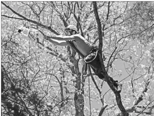
The work climb often involves stretching out a few extra inches, letting you ring the bell and gain additional points.