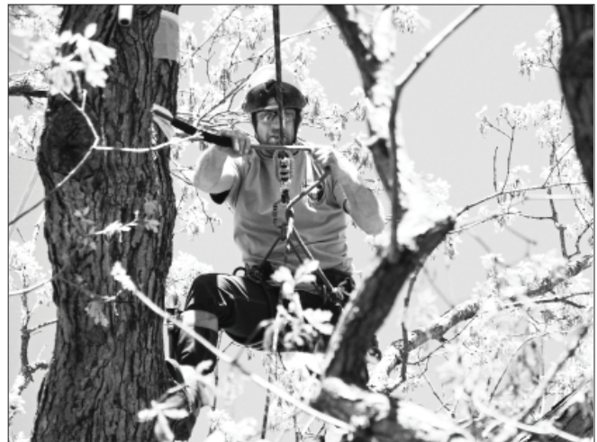
A mid-climb adjustment in the climbing line is often called for and needs to be done cleanly, quickly and safely.