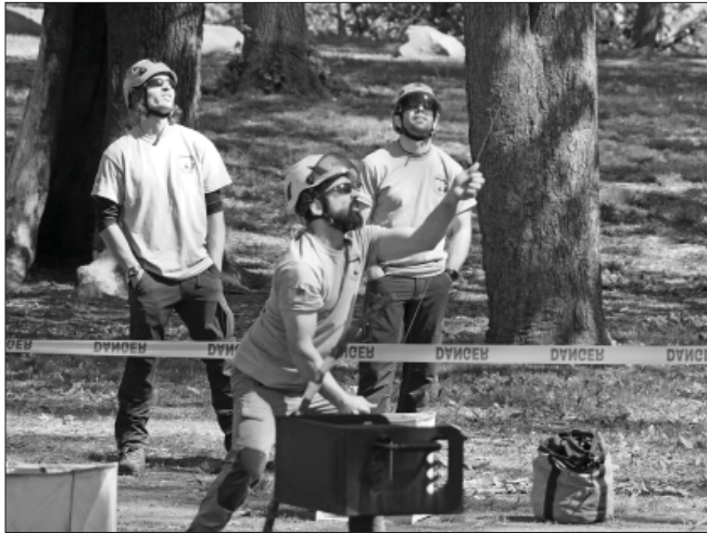
One of the preliminary events involves setting a series of throwlines. It takes patience and quickness, simultaneously.

On May 11, the 15th Annual Connecticut Tree Climbing Competition was held in New Haven, in the College Woods section of East Rock Park. 29 Climbers participated - 26 men and 3 women. Many thanks to the number of volunteers who donated their time and more to help make the day a success. Thanks, as well, to all the people who turned out to watch. Finally, thanks to the City of New Haven, for being such a gracious host.