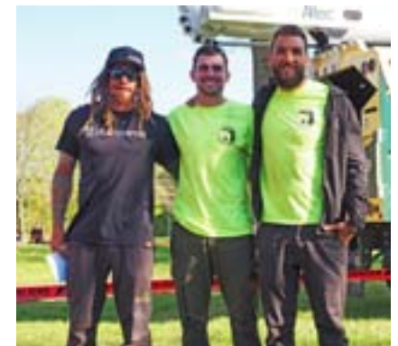
CT Climbing Competition, Fairfield Hills Newtown, CT - May 6,2023