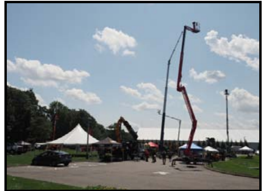
Summer Meeting 2023