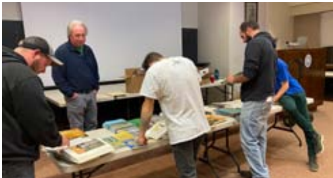
Arbor 101 Winter 2023

These Articles of Association may be amended from time to time as recommended by the Board of Directors and approved by a two-thirds majority of the members at a meeting of the association called in accordance with the Association By-Laws.