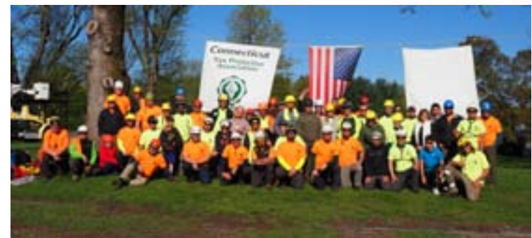
Fairfield Hills, Newtown, CT - May 6, 2023

The UCONN Partnership Committee was founded in 2018 after an opportunity opened up to help UCONN's Ratcliffe Hicks School of Agriculture, two year Applied Science degree program. The committee's goal is to stay in communication with UCONN and help in anyway they can so that the major is properly supported while it gains momentum. Ultimately, the goal is to have well rounded, educated students come into the work force ready for the industry.