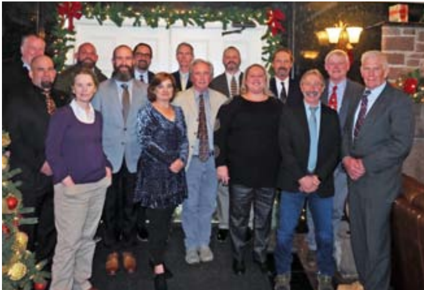
CTPA Board of Directors 2023