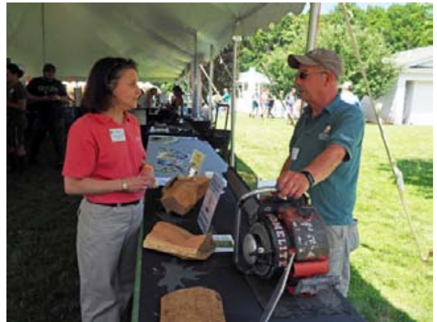
Summer Meeting 2023

Visit the CAES Web Site at www.ct.gov/caes