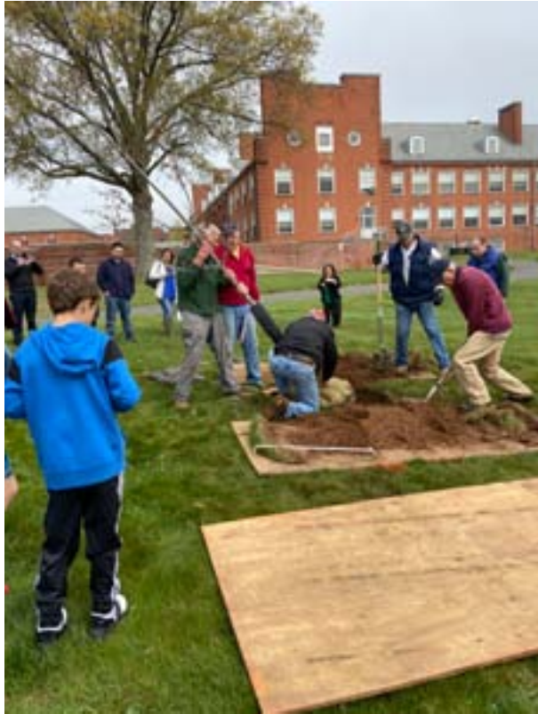
Arbor Day, Veterans Home and Hospital Rocky Hill - April 28, 2023