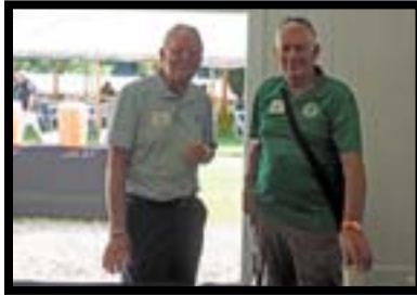
Summer Meeting 2023