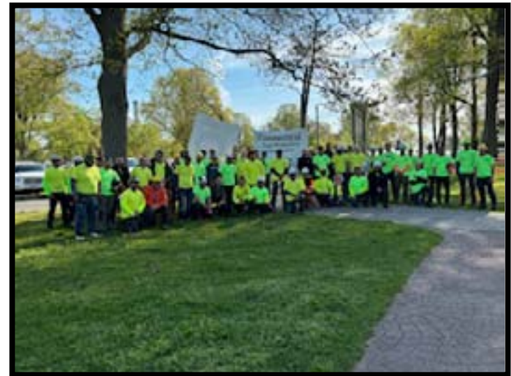
Seaside Park, Bridgeport, CT - May 4, 2024

The UCONN Partnership Committee was founded in 2018 after an opportunity opened up to help UCONN's Ratcliffe Hicks School of Agriculture, two year Applied Science degree program. The committee's goal is to stay in communication with UCONN and help in anyway they can so that the major is properly supported while it gains momentum. Ultimately, the goal is to have well rounded, educated students come into the work force ready for the industry.