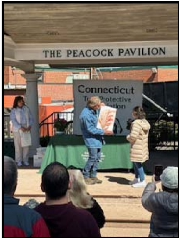
Arbor Day, Beardsley Zoo Bridgeport - April 26, 2024