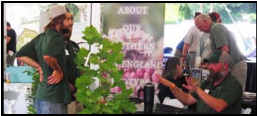
2023 Summer Meeting

Zitnay, Douglas 5 Old Pine Orchard Road Branford, CT 06405 Darling Gardens, LLC 203-619-2374 1darlinggardens@gmail.com Arborist License #: S-5197