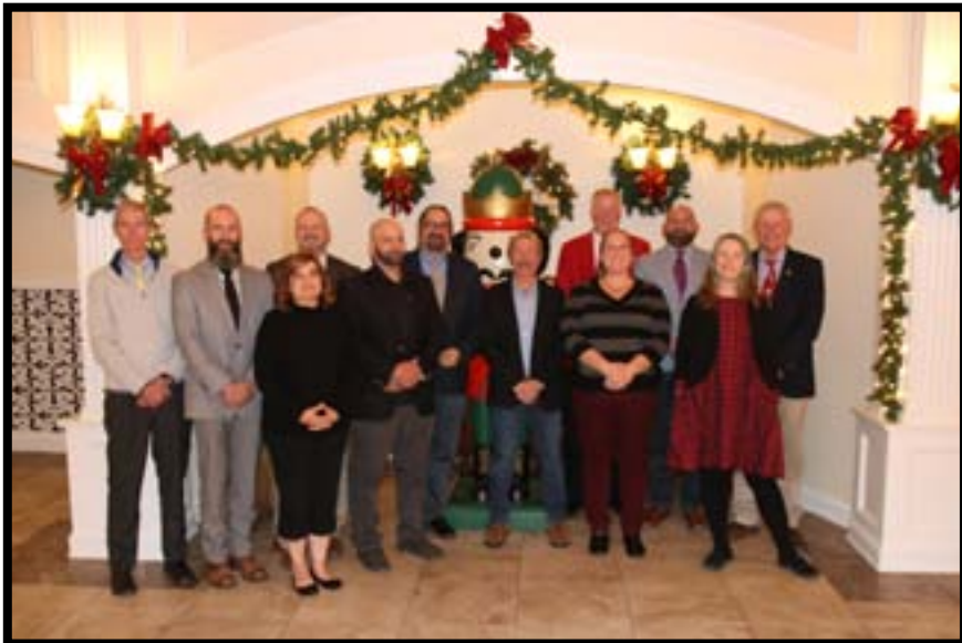
CTPA Board of Directors 2024