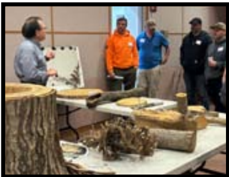
Arbor 101 Winter 2024

These Articles of Association may be amended from time to time as recommended by the Board of Directors and approved by a two-thirds majority of the members at a meeting of the association called in accordance with the Association By-Laws.