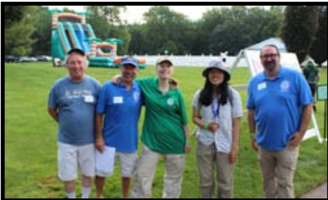
The Connecticut Tree Protective Association, Inc.