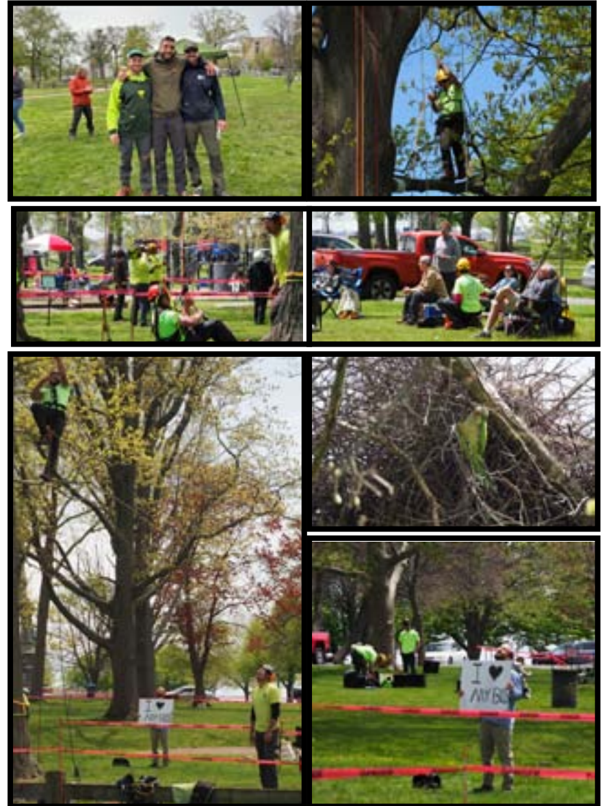
CT Climbing Competition, Seaside Park Bridgeport, CT - May 4, 2024

SECTION 2. – A Board Member or Officer may resign at any time, provided such Board Member or Officer submits a letter to that effect to the Board.