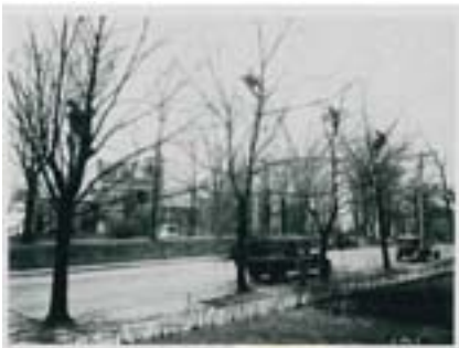
Tree Work 1930's

These Articles of Association may be amended from time to time as recommended by the Board of Directors and approved by a two-thirds majority of the members at a meeting of the association called in accordance with the Association By-Laws.