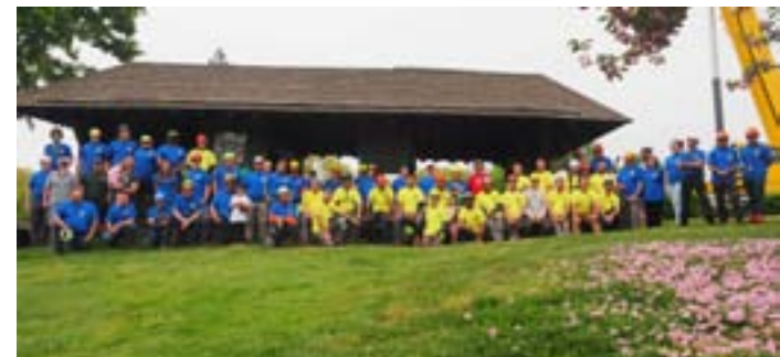
Boothe Park, Stratford, CT - May 14, 2022

The UConn Partnership Committee was founded in 2018 after an opportunity opened up to help UConn's Ratcliffe Hicks School of Agriculture, two year Applied Science degree program. The committee's goal is to stay in communication with UConn and help in anyway they can so that the major is properly supported while it gains momentum. Ultimately, the goal is to have well rounded, educated students come into the work force ready for the industry.