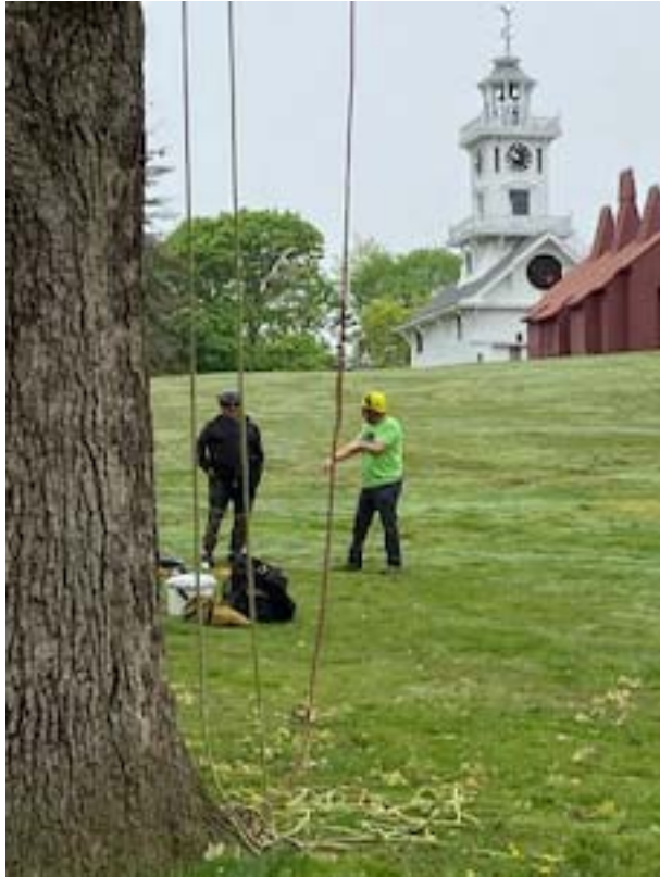
Climbing Competition - May 14, 2022, Boothe Park, Stratford, CT