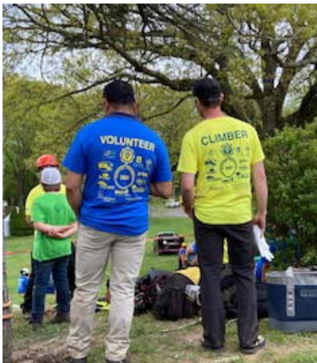
Climbing Competition - Volunteer and Climber 2022

Visit the CAES Web Site at www.ct.gov/caes